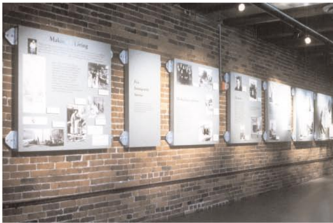
Exhibit elements such as casework and wall panels were designed with a clean, industrial-type look and finish to complement the building fabric of the renovated historic warehouse location. Striving to allow the immigrants to tell their own stories with only minimal third person labels, objects and large photographic murals were integrated with personal stories selected from the oral history project. The open multi-storied

The oral histories served as the primary source of information but the interviews lacked the necessary objects, documents and photographs required to mount an exhibit, and the historical society had only a minimal collection of Italian American materials. Don encouraged the oral historian/curator to institute a region-wide collecting initiative and he helped focus the collecting activities by pinpointing specific objects, documents and photographs that would best tell the story of the Italian American experience. The collecting initiative yielded a wide range of objects and documents: tools, clothing, visas and passports, personal letters, diaries, family photographs, religious statuary and stained glass windows.